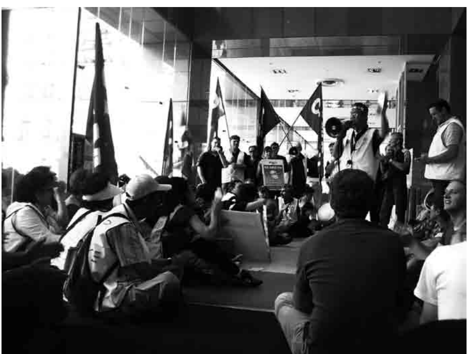
Sydney, 30 October 2009: CFMEU union building workers and their supporters occupy ANZ Bank headquarters in Martin Place in opposition to the bank's refusal to pay workers entitlements for a failed construction project that it had taken over. Including a large contingent of Korean-speaking unionists and their supporters, a highlight of this action was the multiracial crowd being led through chants of "The Workers United Shall Never Be Defeated" in both English and Korean! Despite attempts by the NSW police, hands on gun holsters, to intimidate the crowd the protestors held their ground until ANZ bosses agreed to a meating with union officials. The organised workers movement has the power to smash the ABCC and defeat all the `Workchoices Lite' anti-strike laws.