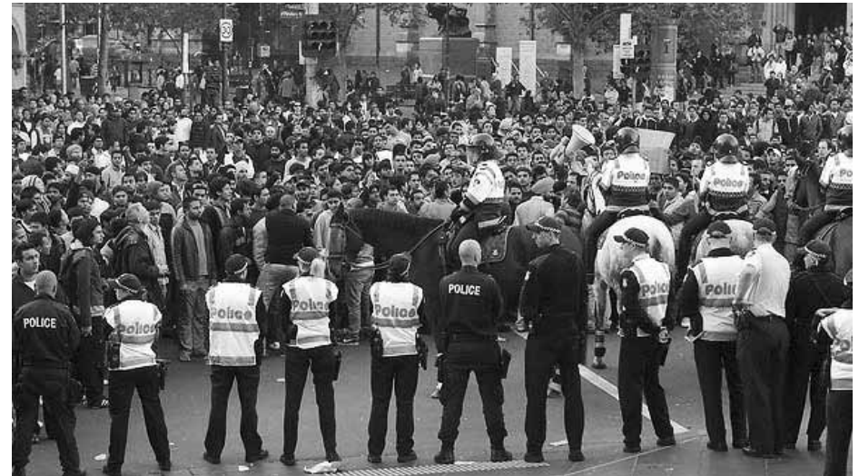
Police lined up in front of demonstrators at the May 31 anti-racist rally in Melbourne.

The main responsibility for defending Indian and other international students lies with the workers and left and student movements in Australia. However, Indian students can make such solidarity more likely by ensuring that their own slogans are clearly anti-racist and have no hint of Hindu nationalism. Unfortunately, in India the widespread anger over the racist attacks on Indian students in Australia has been partially hijacked by the Hindu chauvinist Bharatiya Janata Party (BJP) and the even more extreme Shiv Sena (SS.) The BJP/SS's prejudice against Muslims, low-caste people and the darker skinned