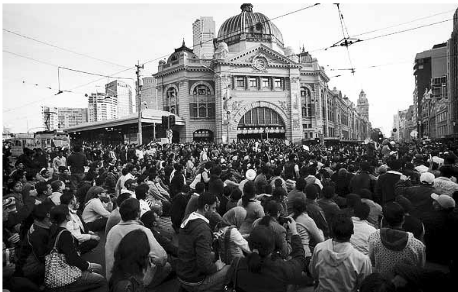
31 May 2009, Melbourne: Indian students and their allies take a stand against racist attacks. Thousands of protesters staged a sit in at a busy city intersection.

INDIANS, LEBANESE, CHINESE, TRADE UNIONISTS & ALL ANTI-RACISTS UNITE BUILD GRASSROOTS, ANTI-RACIST PATROLS!