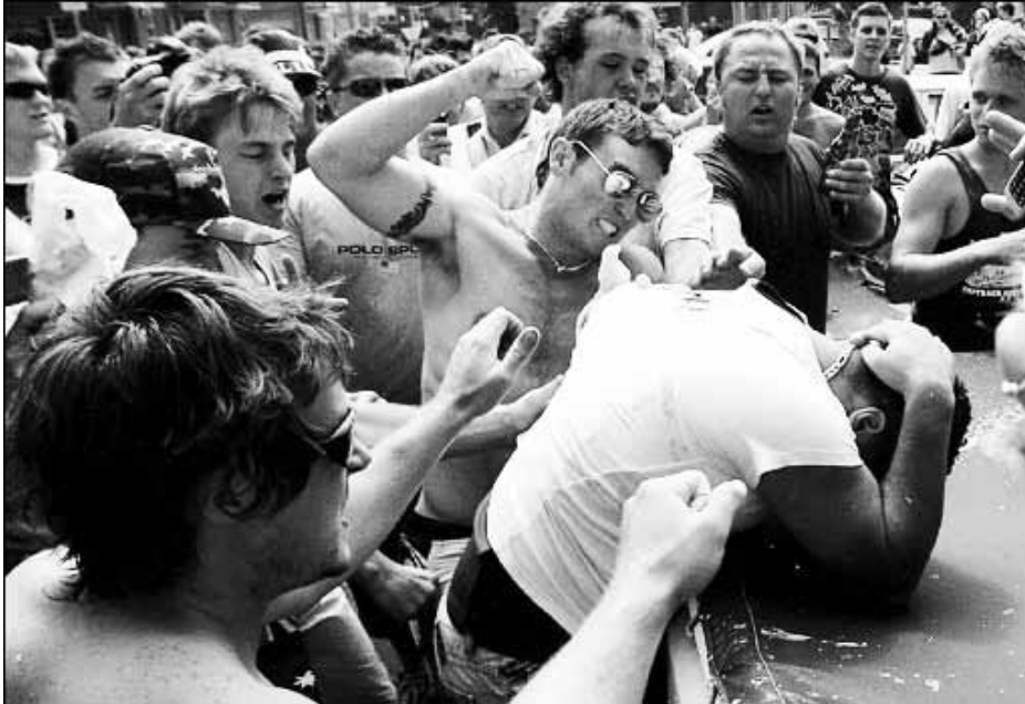
Cronulla, Sydney, December 2005: Notorious white supremacist riot against Middle Eastern and other non-white people. Lebanese, Indians, East Asians and anti-racist whites should unite in trade-union centred mobilisations against racist violence. Make the beaches safe for people of all colours!