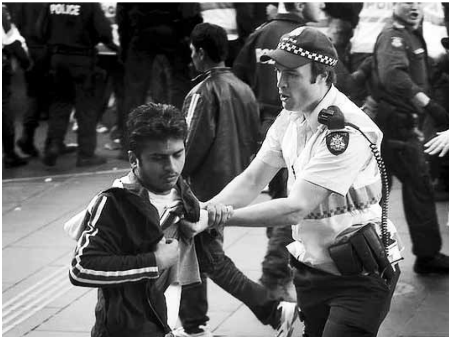
Police repression unleashed against anti-racist demonstrators. Police arrested 18 students at the May 31 anti-racist rally. In contrast police have shown an apathetic attitude to stopping the racist attacks. Capitalist police can never be an ally in the struggle against racist violence.

police assaults on picket lines of workers striking against job cuts; and more attacks against people protesting against the occupations of Iraq and Afghanistan. Indeed for this very reason, some right-wing media commentators, who are normally responsible for whipping up White Australia racism, have cynically seized on the Indian students issue to push a “law and order” agenda. They want to, for example, undercut concern about the trigger-happy NSW cops being issued with taser weapons. If these “law and order” hardliners get their way then we had better watch out when we participate at the next protest against racist violence! So let us not fall for this so-called “law and order” agenda! No to more racist police – No to these cops having tasers! Let us organise multiracial self-defence squads of students and trade unionists to quell the violent attacks on Indian students!