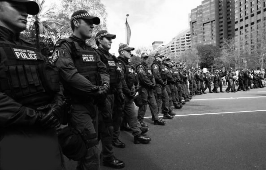
Australian capitalist "democracy" at work: Massive police mobilisation intimidated anti-war demonstrators protesting at the September 2007 APEC Summit in Sydney.

Despite Rio Tinto's best efforts to wash their hands of this scandal they have been considerably tainted by it. The PRC's exposure of the corruption of four of Rio's top China-based executives and the Shanghai court verdict's implication of the Australian