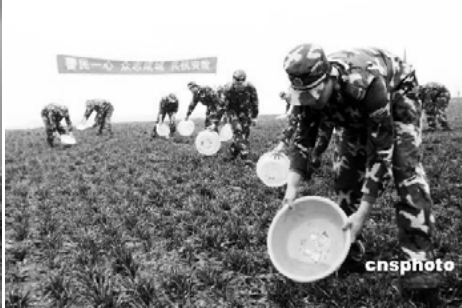
Serving the people. Feb 7, 2009: Several thousand of the Peoples Republic of China's police mobilise in Henan Province to help poor farmers combat the drought.

confidential information would have had to be known by Rio Tinto's Australian headquarters. The Shanghai office would not have had the authority to lower the price of ore sold to China's major state-owned customers or to suddenly transfer a ship of ore to a particular customer without the approval or at least knowledge of head office. Indeed, even in its frontpage March 24 article "exonerating" Rio Tinto, The Australian newspaper had to admit that: