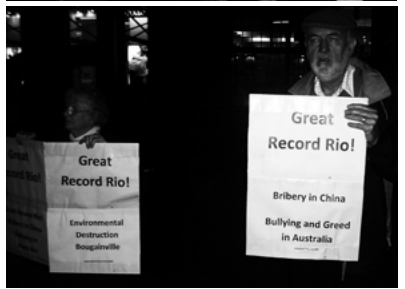
Demonstrators taking a stand at the May 20 rally in Sydney.

this is not the only or indeed even the main factor involved. What mainly drives the militant defenders of the arrested executives is, on the one hand, the class loyalty of capitalist politicians to capitalist executives and, on the other hand, the hatred that capitalist representatives have for socialistic states. If indeed it was only racism that was motivating the hardline backers of the arrested executives then why have ethnic-Chinese anti-communists also demanded a tougher line from Rudd against the PRC? For example, the Epoch Times, the paper of the Falun Gong group – a right-wing Chinese outfit posing as a religious organisation - published an article on 12 August 2009 headlined "Australia Needs to Stand Up for Stern Hu." Meanwhile, in attacking China's arrest of the Rio Tinto bosses, Barnaby Joyce, Michael Danby, Malcolm Turnbull and the Murdoch press highlighted not the racial or cultural characteristics of the Chinese people but the reality that in the "communist Peoples Republic of China" the key industries are dominated by state-owned enterprises; and that these enterprises operate not according to the profit motive but are subordinate to the state that is run by communists. However, you won't find any references to such statements by these people in the Socialist Alternative's journal. For if