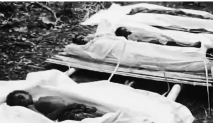
Bougainville people killed in years long Civil War from 1988. Australia's PNG puppet forces, Australian military "advisers" and mercenaries and PNG/Australia's starvation naval blockade killed 15,000 Bougainvilleans in the service of Rio Tinto.

a lack of medicines. Alongside the hundreds upon hundreds killed by gunfire, 14,000-15,000 Bougainville people ended up dying as a result of the genocidal eight-year blockade. In all the PNG state authorities and their Australian imperialist masters killed off some 10% of the island's entire population. All this to try and help CRA/Rio Tinto to resume their plunder in Panguna.