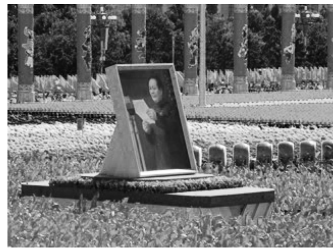
Beijing, 1 October 2009: A giant portrait of Mao Tse Tung heads the official parade to mark the 60th anniversary of the founding of the Communist Party-led Peoples Republic of China.

What the furore over both the Chinese investment proposals and over the jailing of the Rio Tinto executives has highlighted is the fundamental difference between the political system in the PRC and that in capitalist countries. The PRC has been shown