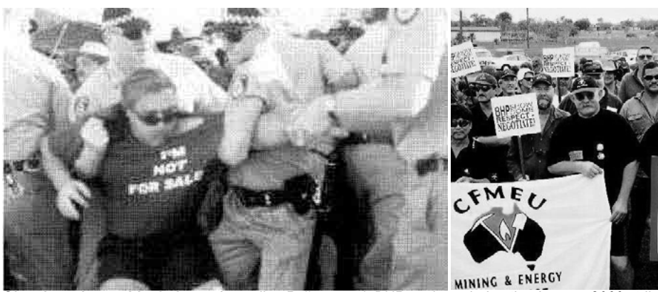
Showing whose side their on: Australian Police attack BHP workers during the January 2000 strike at the Mt Newman mine in the Pilbara