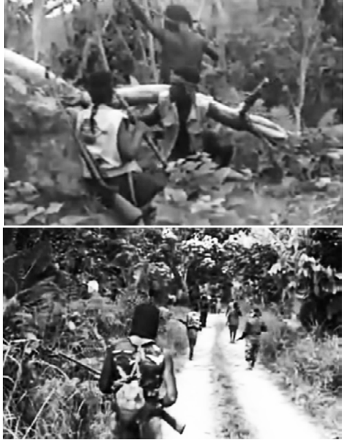
Taking a stand against Rio Tinto (whose Australian wing was then called CRA): Bougainville Revolutionary Army (BRA) freedom fighters in action. BRA rose up against CRA's failure to share revenue and provide proper compensation for its massive copper mine in the PNG island of Bougainville. Bougainville resistance forces shut down the mine in 1988.

villagers against CRA's (Rio Tinto's) mining lease. For the next two decades, CRA continued on their merry way. Having driven out hundreds of people to establish the mine, they then made little effort to protect the island and its people from the effects of mining. They simply dumped over a billion tonnes of poisonous tailings waste into Bougainville's Jaba river, literally turning the river bright blue, destroying vital fishing stocks and ruining the surrounding area. Despite the Panguna mine, one of the world's biggest open cut mines, raking in spectacular billion dollar profits for CRA's (Rio Tinto's) owners, the company gave an insulting pittance in compensation. However, by 1988 Bougainville's people had had enough. They cranked up the militancy of their anti-CRA struggle. In 1988, villagers managed to briefly shut down the mine through sit-ins and roadblocks and later through daring sabotage actions. Under direction from the Hawke Labor government in Canberra, PNG responded by sending in first riot police and then the military. To direct PNG's war, Australian military "advisers" were directly stationed in Bougainville and Australian pilots flew the Iroquois helicopter gunships that terrorised the local people.