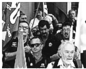
16 February 2010: Trade unionists rally outside Rio Tinto's Melbourne headquarters to protest the company locking out 560 union miners in the Western Californian town of Boron.

The statement went on to note that Rio Tinto was notorious for "abuses of human rights, indigenous land rights, workers' rights and damage to the environment and local communities in Australia, Africa, Bougainville, Indonesia and Iceland." And that is putting it mildly! Let us here briefly examine some of the history of Rio Tinto. Let us look at the ruthlessness of the Australian and British capitalists who run this company.