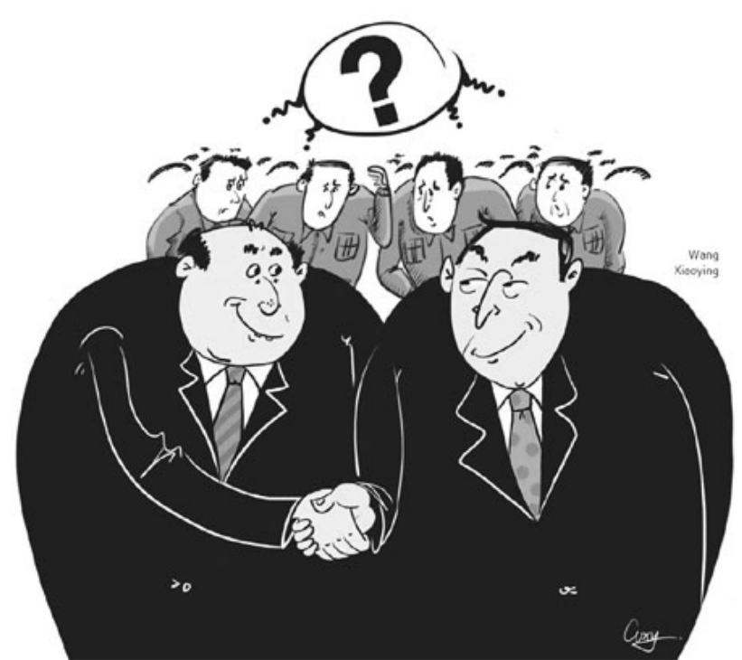
No sympathy for rich exploiters: Cartoon in a Chinese state-owned newspaper article (China Daily, 6 August 2009) about the Tonghua struggle mocks greedy executives keeping workers in the dark. The Tonghua Iron and Steel Group had been privatised but the privatisation was quashed after thousands of workers occupied the plant and fatally bashed the would-be private boss who had been planning mass layoffs. Can you imagine how the Australian mainstream media would react if the same thing happened here?

Revolution. As a result, once Chinese tycoons appear on either the Forbes or Hurun (a rival rich list to Forbes ) rich lists, there is intense public pressure for the government to crack down on them. Beijing often obliges, particularly since the greedy billionaires often turn out to have first got a leg up through an "original sin" act of corruption. Not long after the 2008 Hurun rich list appeared the person who topped the list, Gome Electrical Appliances owner Huang Guangyu, was detained for economic crimes. Hundreds, possibly up to a thousand government officials involved in protecting Huang have also been rounded up. Last June the mayor of Shenzhen, the huge city near Hong Kong, was detained over the affair. And two top police officials including a former deputy minister of public security and a former Shanghai deputy police chief have also been detained on suspicion of bribery in connection with the case. Huang, himself, has remained in custody since his arrest.