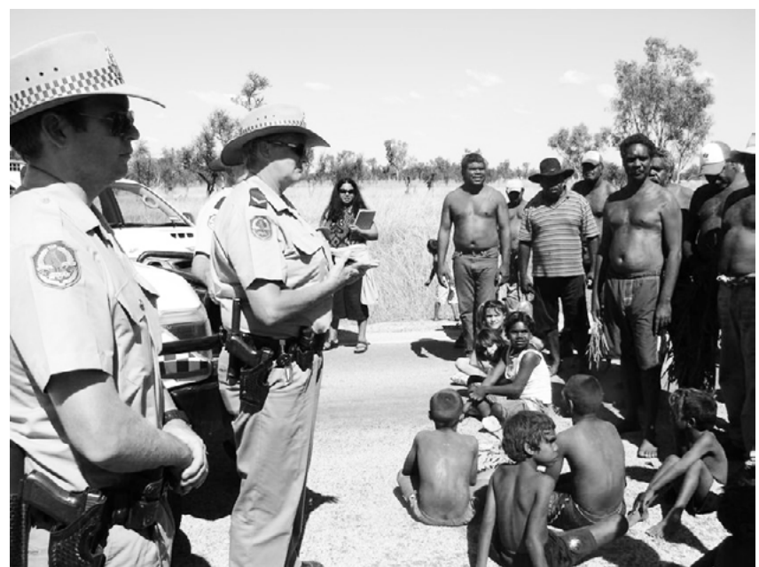
June 2008: Police block Aboriginal people in the Northern Territory's MacArthur River Region from holding a ceremony at a sacred ceremonial site that was on the verge of being destroyed by the expansion of a zinc mine owned by mining giant Xstrata.