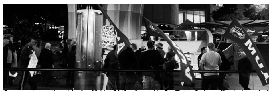
Demonstrators gathered for the 20 May 2010 rally outside Rio Tinto's Sydney office that was built around the call: "China is Cracking Down on Private Sector Corporate Greed and Corruption - It's Time that Happens Here! Stop Rio Tinto's Plundering and Union Busting!". Among those participating were a contingent of representatives of the Sydney Branch of the MUA (Maritime Union of Australia) - carrying the union's trademark red flag.